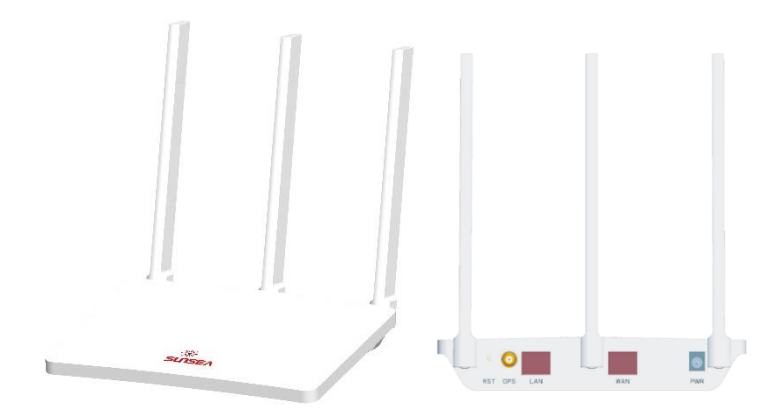
Figure 3-1. Sunlight1000-F appearance and interface

Appearance and interface of Sunlight1000-F small cell are as shown below: